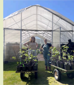
Spring 2023 student interns caring for Cornus sericea outside of the hoophouse.