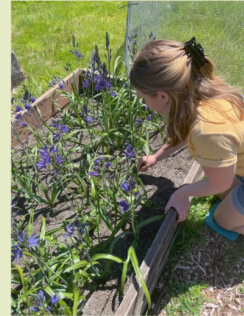
Spring 2023 student interns weeding Camassia bed in the coppice garden.